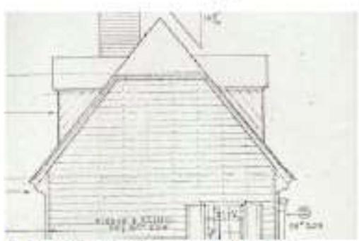
Colonial Comice Return - Acceptable