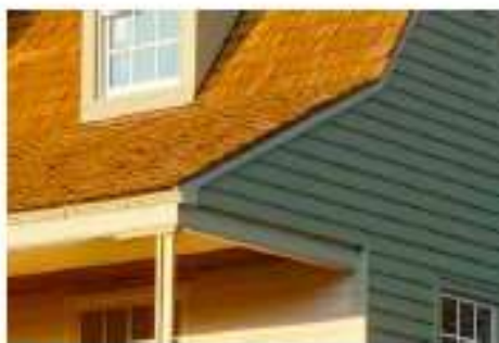
Colonial Cornice Return - Acceptable