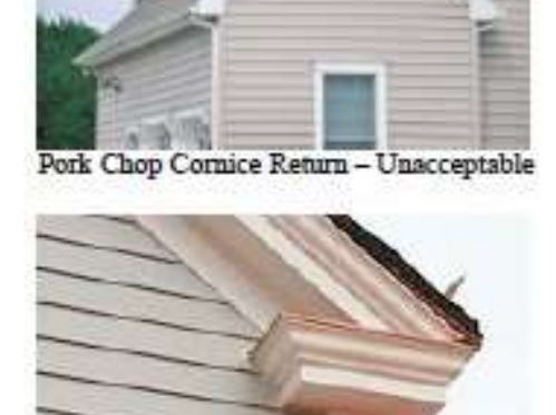
Greek Comice Return - Acceptable