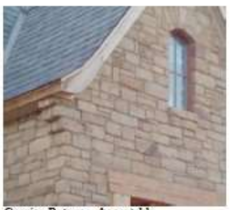
Cornice Return - Acceptable